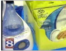
All it takes is cold tap water, and a natural oxidant is created.