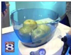
In four minutes or more it will remove any bacteria, viruses and pesticides from your produce, the product's inventor says.